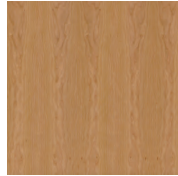
Cherry Flat Cut