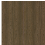
Walnut Flat Cut

Non-standard Species and Stains Over 100 species and cuts available.