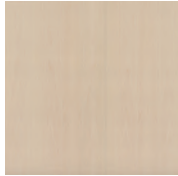
Maple Flat Cut